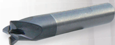
Ø 8 x 44 mm Art.-No. 627020