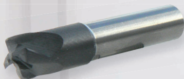
Ø 9 x 44 mm Art.-No. 627021