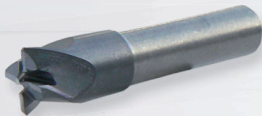
Ø 10 x 44 mm Art.-No. 627022